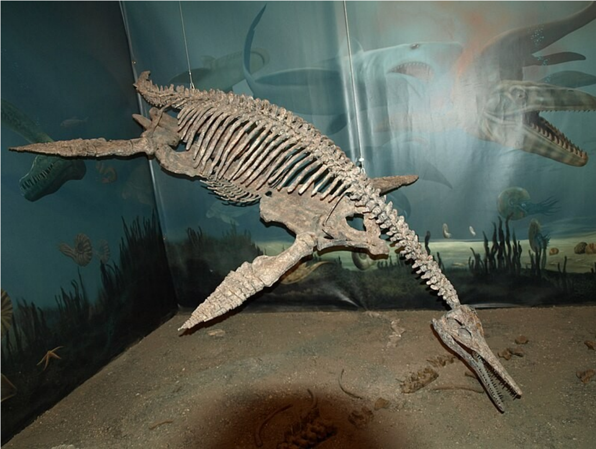
Short Necked Pleisiosaur Fossil at the Canadian Fossil Discovery Centre in Morden, Manitoba

For today and the following two weeks, I'll be blogging lightly. It's summertime and we will be on vacation for a couple of weeks starting tomorrow. The next regular blog on geology and geopolitics will be August 28.