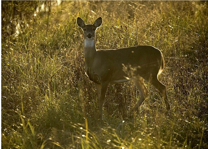
White-tailed Deer Odocoileus virginianus