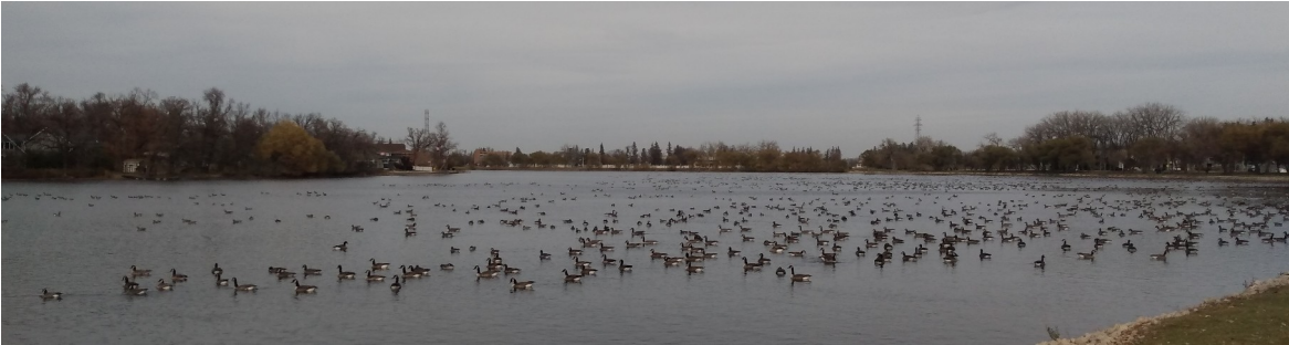
Geese on Crescent Lake, Portage la Prairie, October 27, 2024

I am busy with a bunch of things in the next few weeks. So I will only be posting some news items that I thought were interesting.