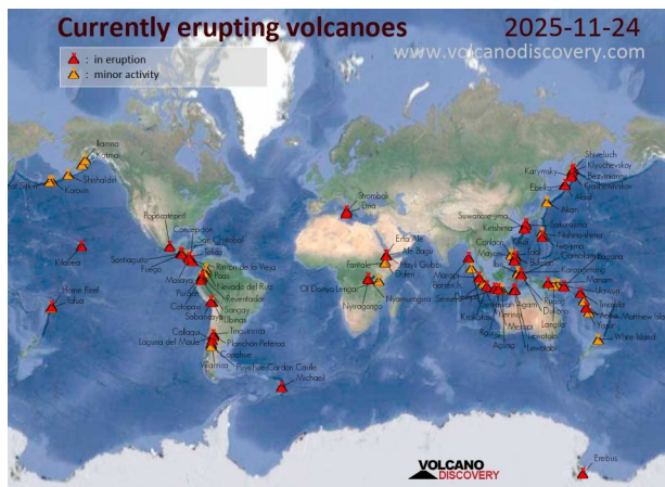
Active Volcano Map