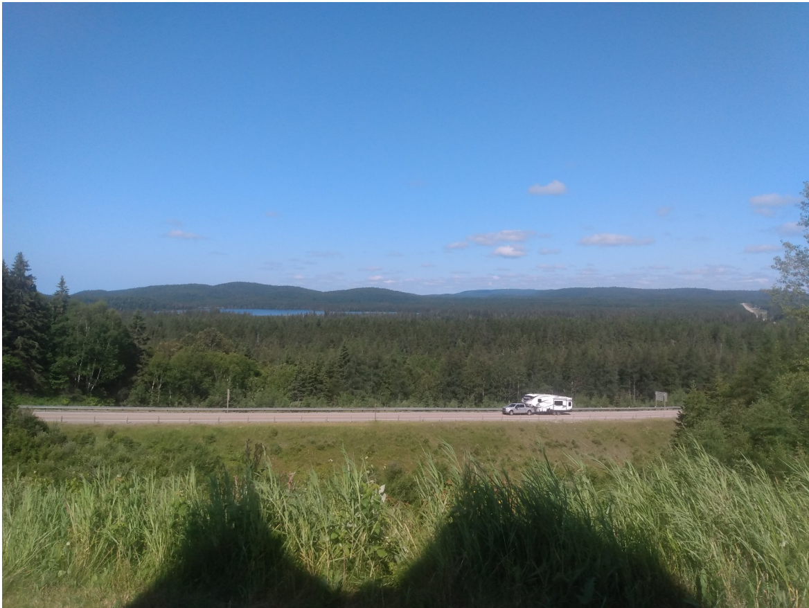
View from the Great Goose at Wawa Ontario , July 12, 2024

I just got back from vacation, so the posting this week will just be news items that I thought were interesting.