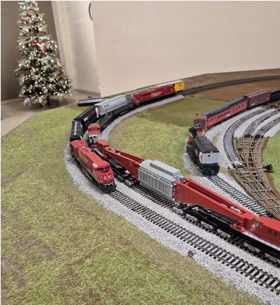
November 29, 2025 - Portage Model Railroad Club display at a Community Event

I've been busy with lots of things, so for this week we just will look at some news items I thought were interesting. The picture above is from a display that my son's club put on for a community event this past weekend.