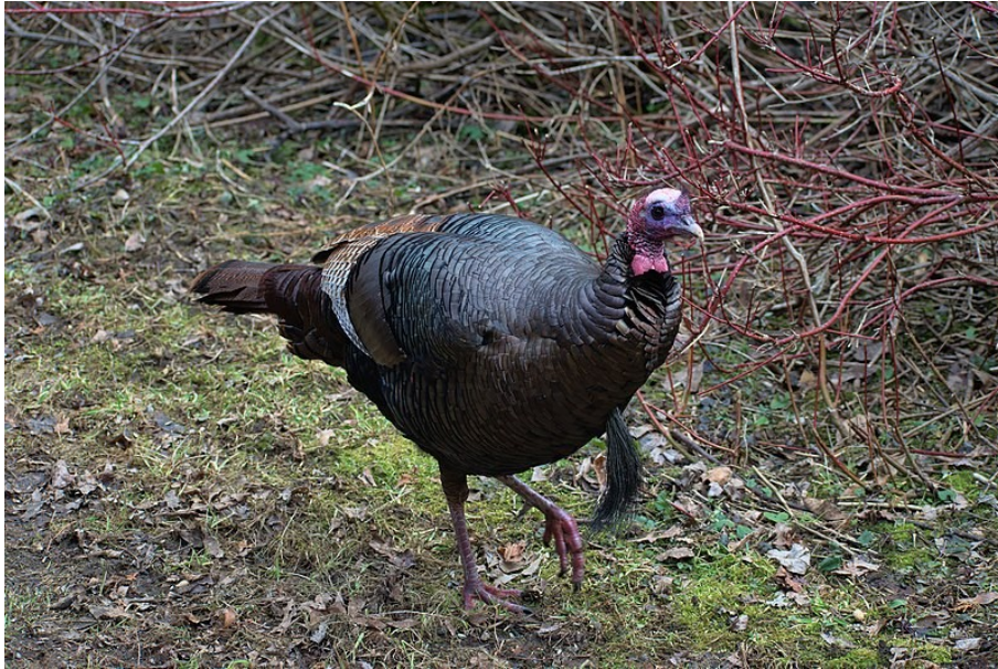
Wild Turkey, Not Looking Forward to Canadian Thanksgiving

This week I have lots of commitments, so I will only be posting news items I thought were interesting.