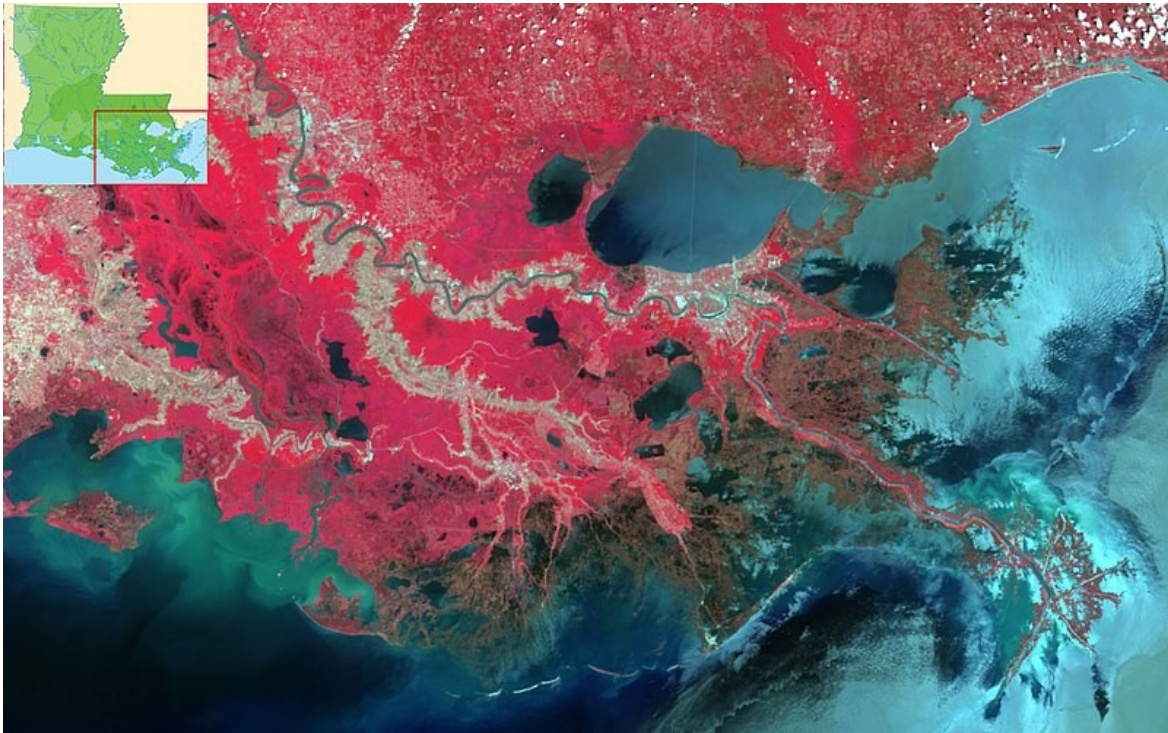
Mississippi River Delta. False-color photograph with vegetation in red.